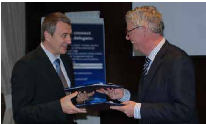
Signing of the Operating Plan with Bulgaria, 17 October 2013

EASO contributes to the coherent implementation of the EU's common European asylum system. It facilitates, coordinates and strengthens practical cooperation among Member States on asylum issues. It offers practical, technical and operational support including evidence-based input for EU policy making and legislation. EASO is a centre of expertise on asylum.