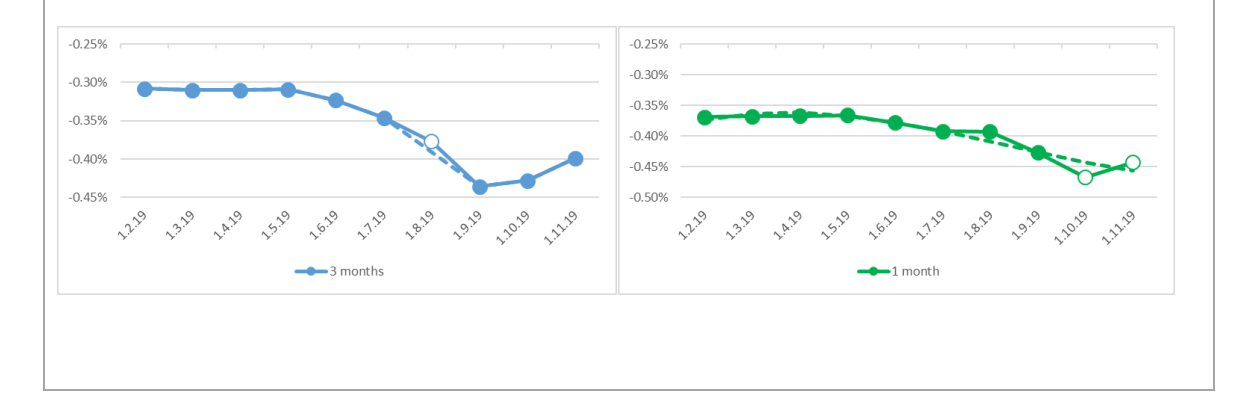
Figure 1: interpolated value starting from the values of the given risk factor observed on previous and subsequent dates (left figure) and extrapolated value starting from the values of the given risk factor observed on previous dates (right figure)

Once a given risk factor has passed the modellability assessment, institutions should fulfil the conditions in this GL, to ensure that the data inputs used for that risk factor are appropriate. For that purpose, institutions could employ, among others, interpolated or extrapolated data. Interpolation or extrapolation techniques can be divided into two types. The first type of techniques produces the interpolated/extrapolated value starting from the values of the given risk factor observed on previous and subsequent dates. The second type of techniques produces the interpolated value starting from the values of other risk factors (e.g. neighbouring grid points of an interest rate curve) observed on the same date. Figure 1 below provides two examples of the first type of techniques.